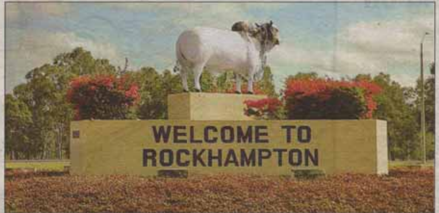
Mackay's population will continue to outgrow Rockhampton over the next 20 years, with projections estimating that city's population will almost stagnate.